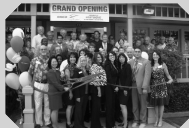
Union Bank 651 San Ramon Valley Blvd, Danville