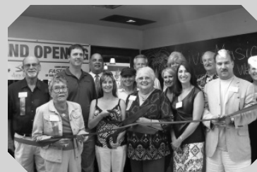
The Wild Vine Hideaway 120 E. Prospect Ave. Danville