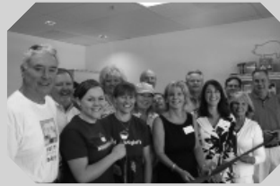
Miglet's Cupcake Shop 480 San Ramon Valley Blvd. Ste A2, Danville