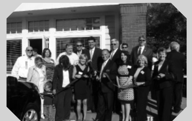
Fremont Bank 210 A Railroad Ave., Danville