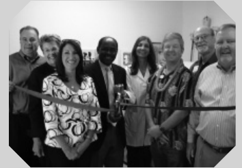
Essential Aesthetics 822 Hartz Way, Ste 204