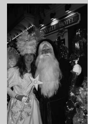
Father Christmas and the Snow Angel