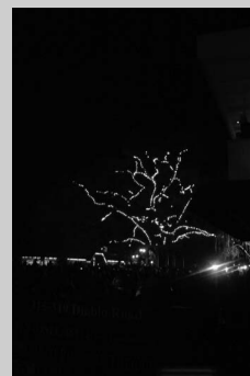
Old Oak Tree